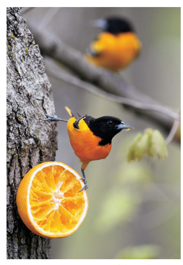
THE BALTIMORE ORIOLE investigating an orange in the foreground— clearly this photo's focal point—creates an energetic counterweight to the bird out of focus behind.

Always think about what you are trying to say with an image. If you are making a photograph of an isolated farmhouse on the prairie, it must be large enough so that people can see what it is, but it shouldn't fill so much of the frame that the viewer loses the sense of its environment