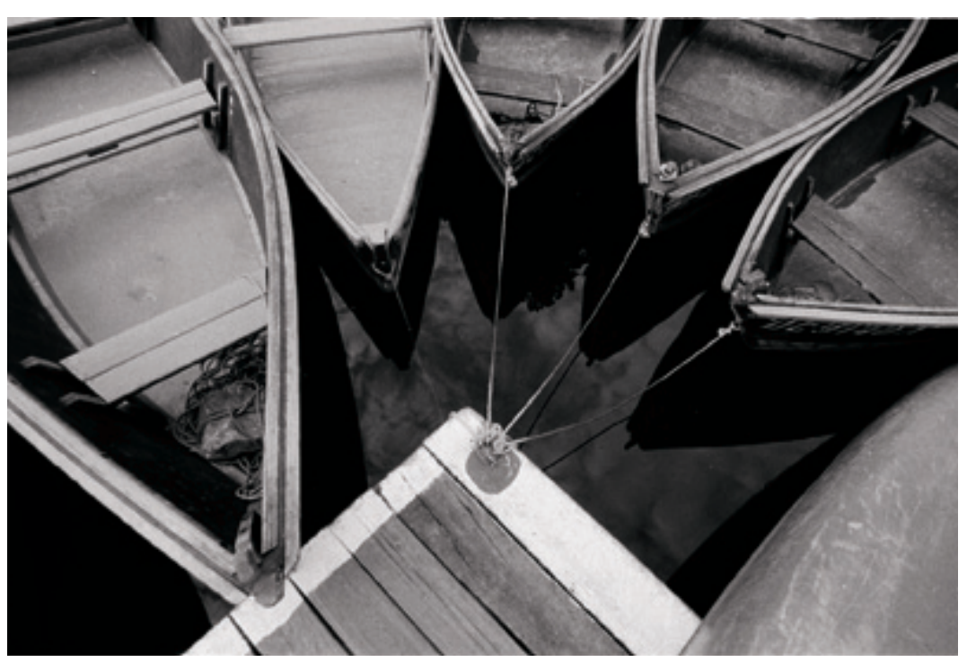
Washington, D.C., U.S.

Don't use the camera rectangle to frame all your pictures. Look for other framing possibilities within the scene, such as an arch or the shaded walls of a canyon.