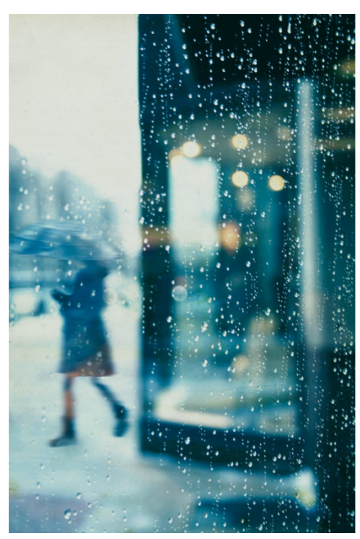
Massachusetts, U.S.

In cultures where photography is uncommon, show your subjects the picture on the camera's display screen. It lets them know what you're up to.