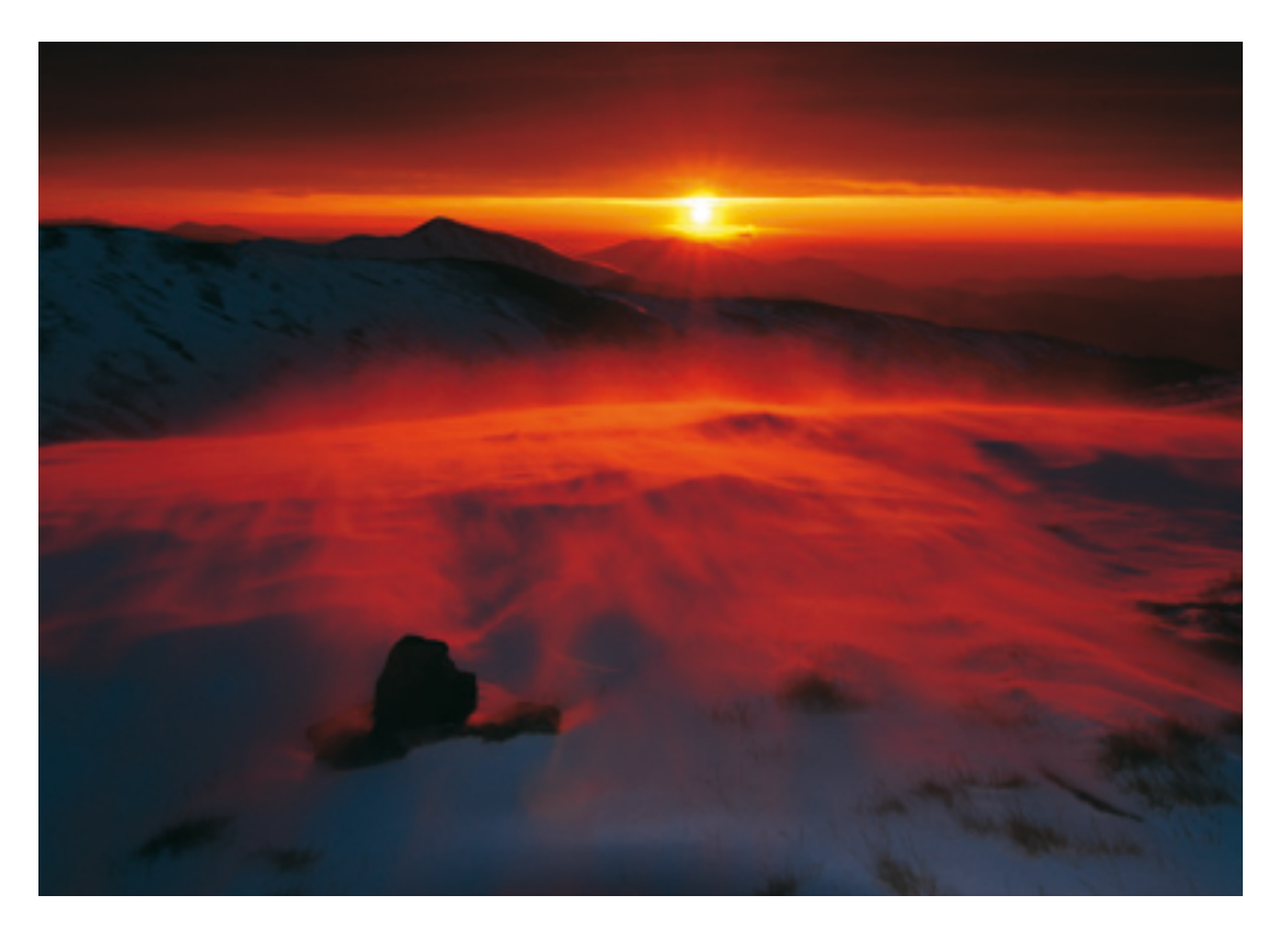
THE MORNING SUN washes this frozen landscape in a red glow of low-temperature light.