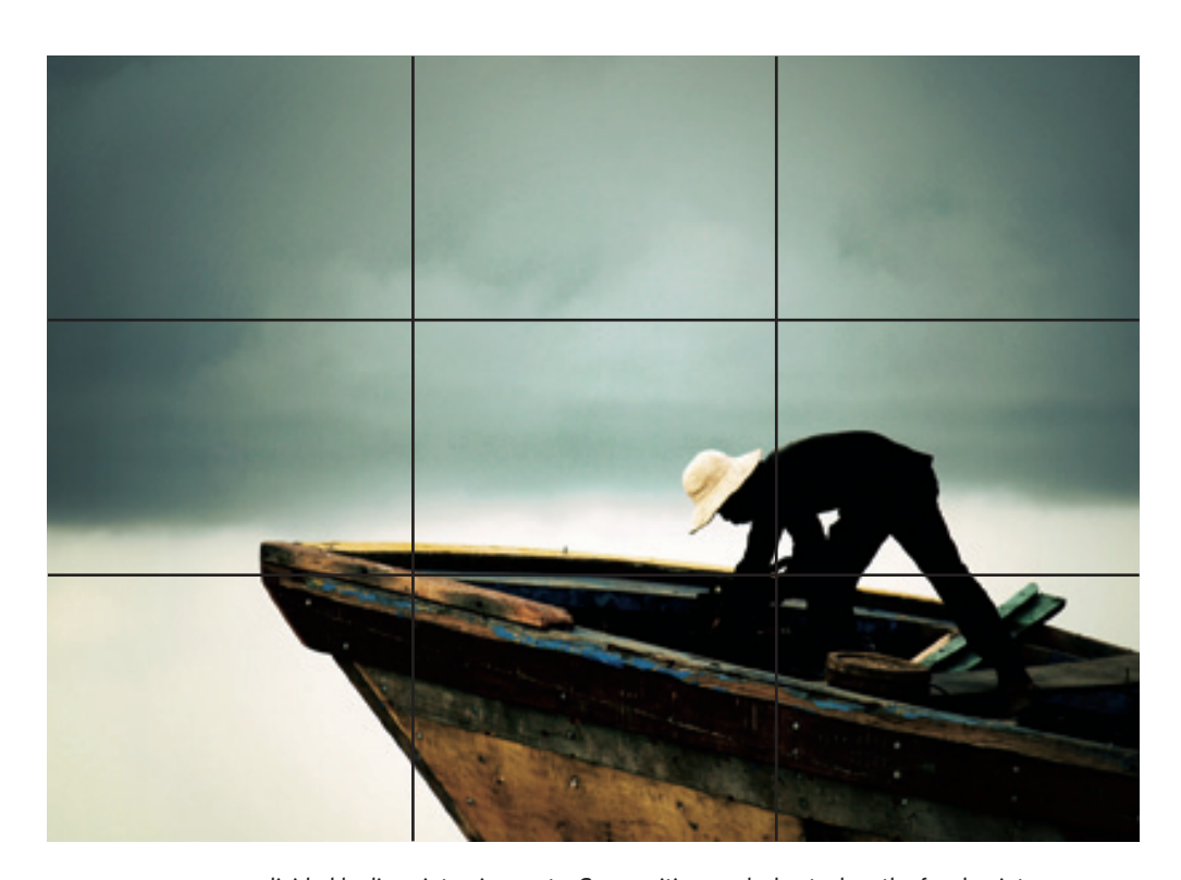
IMAGINE YOUR PHOTO divided by lines into nine parts. Composition works best when the focal point occurs near one of the "sweet spots" where lines meet.

▶▶ To get an idea of how effective off-center composition is, glance at some magazine covers. You'll notice that the subject's head is usually in the upper right of the frame so that our eyes travel first to the face and then left and down.