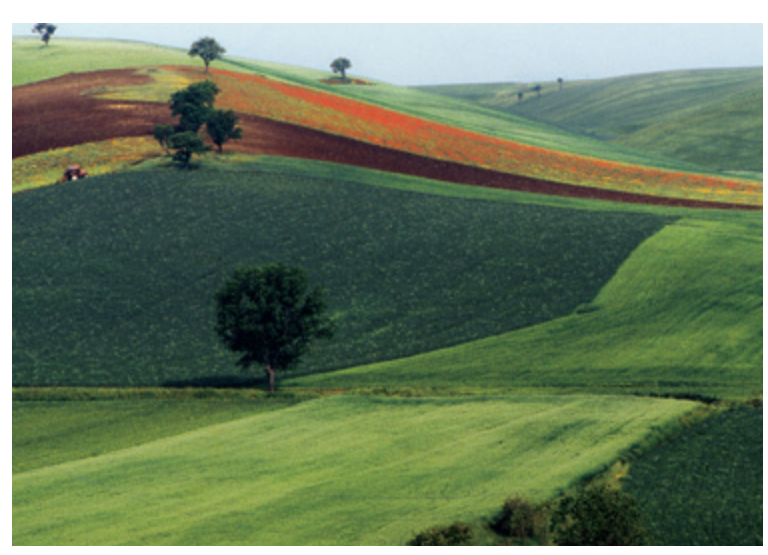
Puglia, Italy

In every carefully considered photographic accomplishment, four elements are vital: subject, composition, light, and exposure. In this book, we will use the shorthand of the icons below to highlight the choices that make a successful photograph.