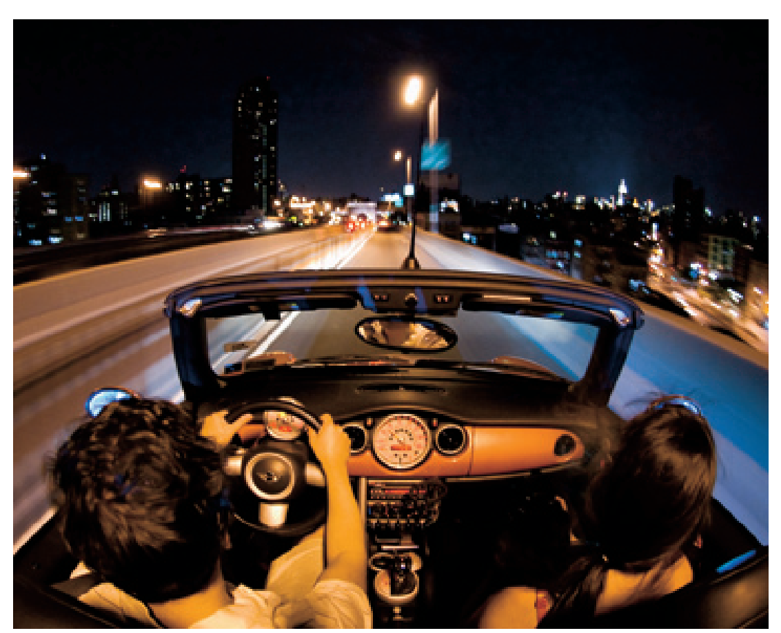
New York, New York, U.S.

Photograph friends engaged with the destination, not just staring at you. Photograph them looking at the view, inspecting the flowers, or pointing the way instead of just smiling at you.