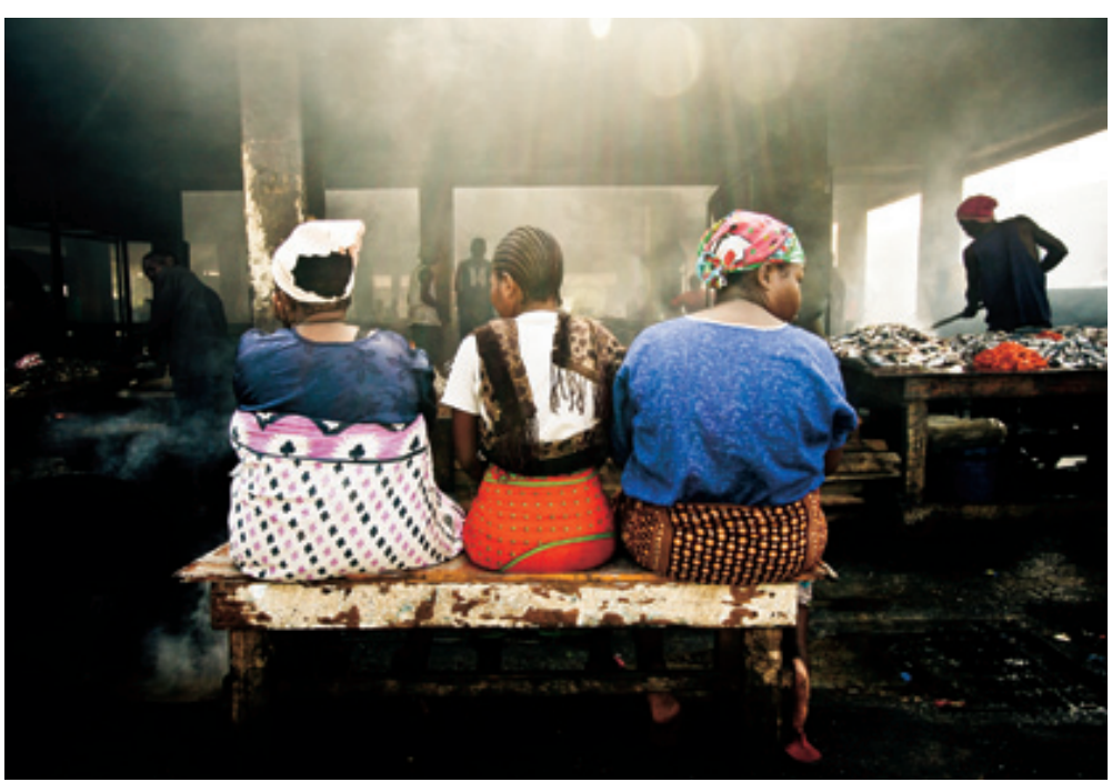
Chasen Armour/ National Geographic My Shot Tanzania

▶► Since we usually look for details, it can be harder to see blocks of color or shape. Squint a bit. Details will blur, and you will see things as masses.